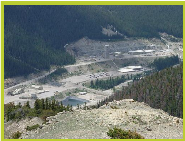
Henderson Mine from Stanley Mt.