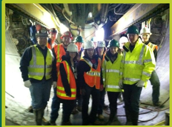
Students given a tour of the U-link Project, an expansion to Seattle's light rail system